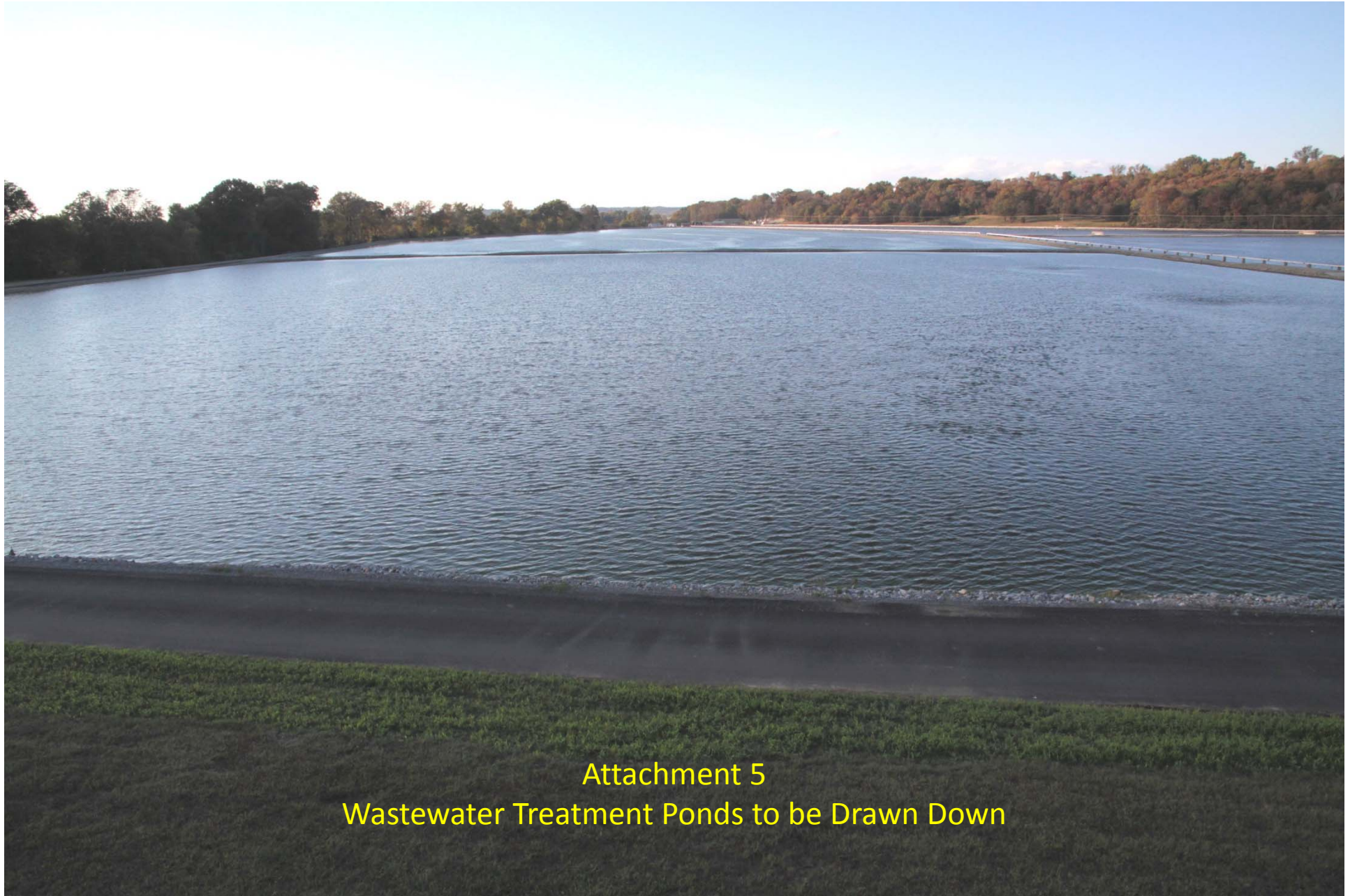
Attachment 5 Wastewater Treatment Ponds to be Drawn Down