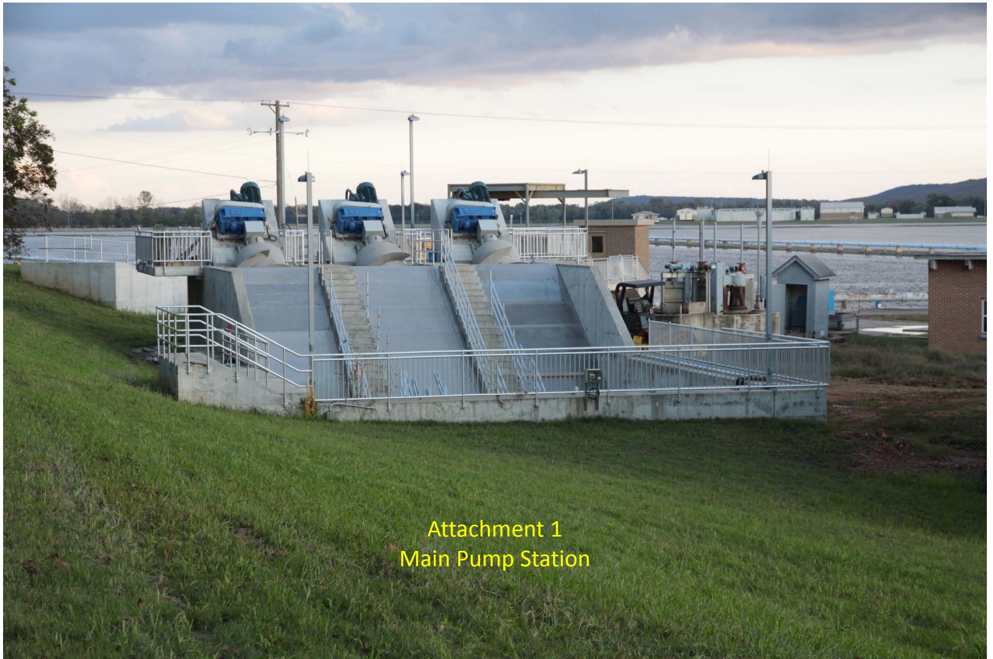
Attachment 1 Main Pump Station