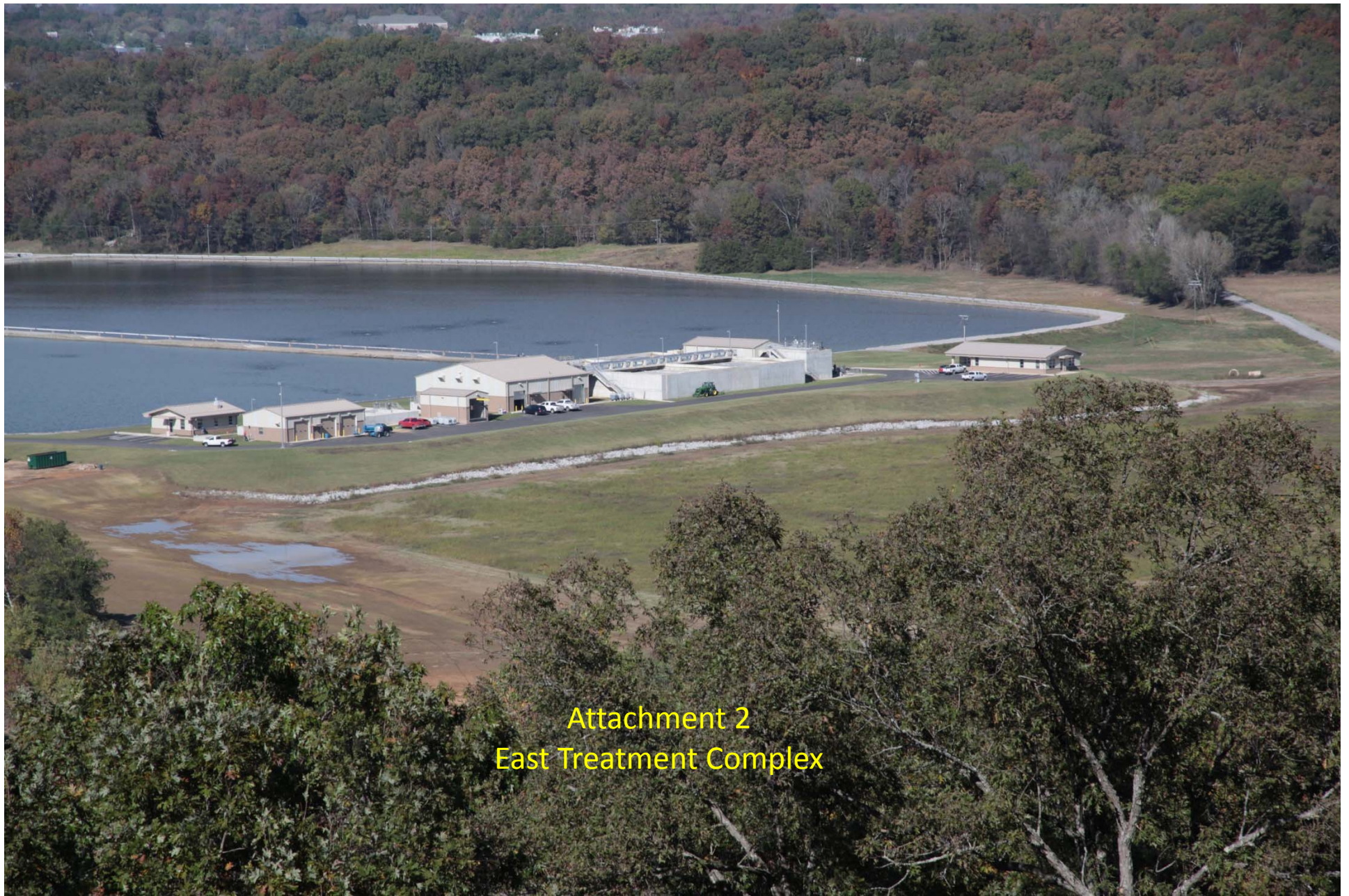
Attachment 2 East Treatment Complex