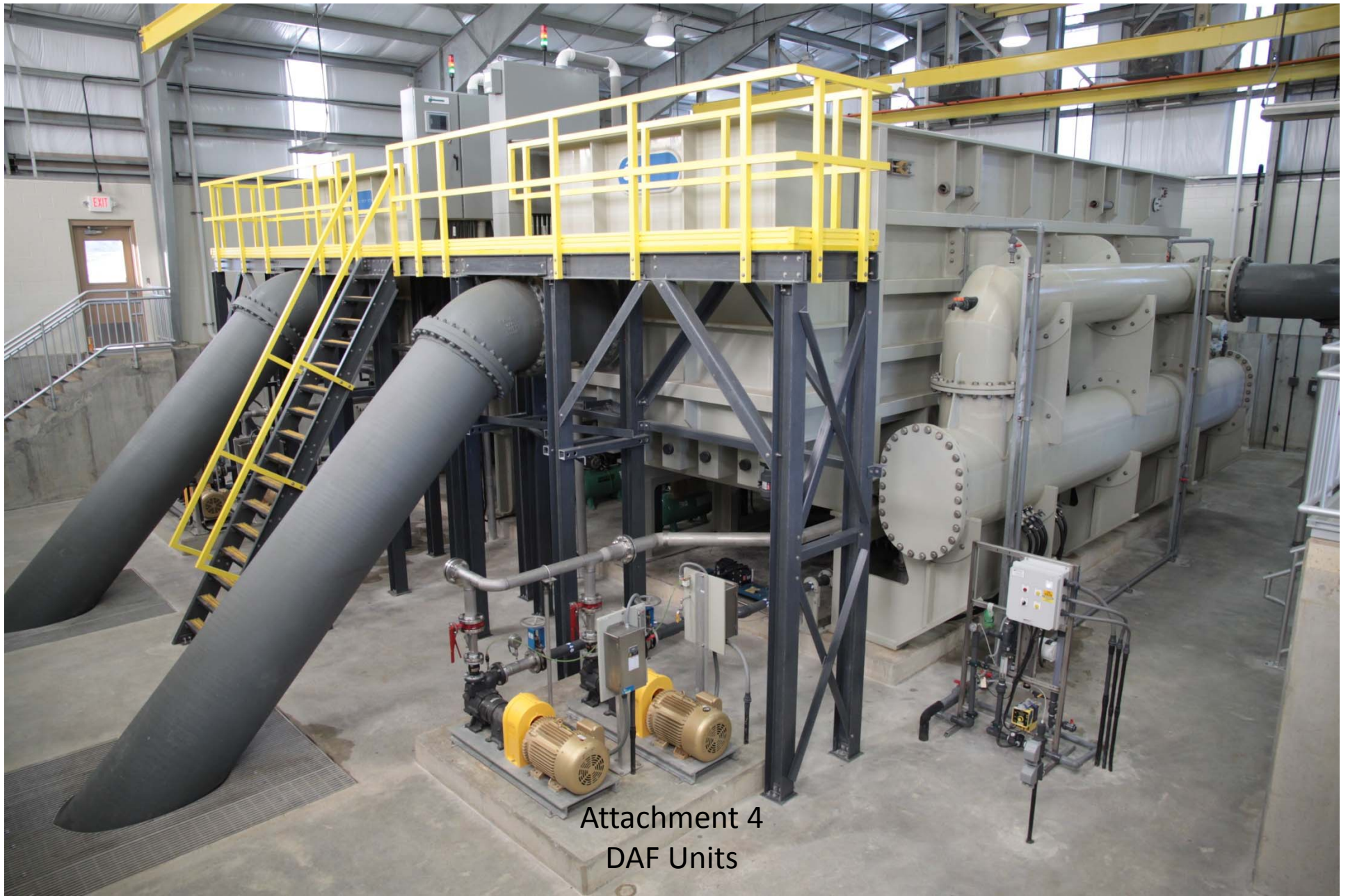
Attachment 4 DAF Units