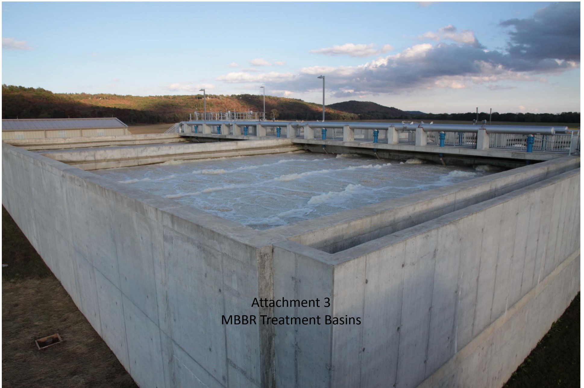
Attachment 3 MBBR Treatment Basins